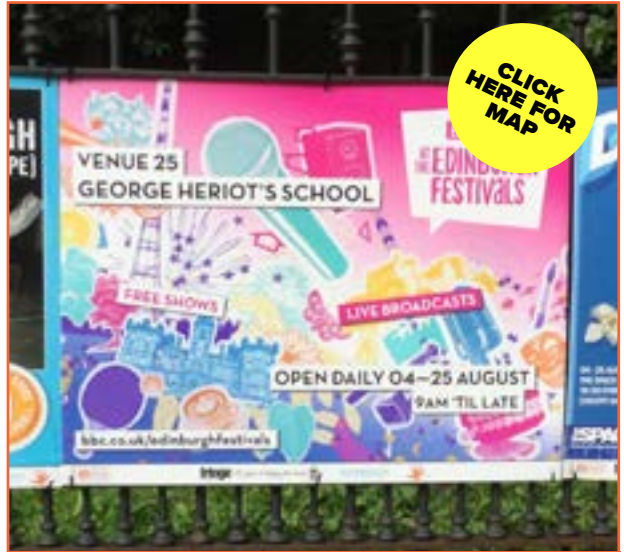
RAILING BOARDS - 30" x 40" (Quad)

SPARE / REPLACEMENT RECOMMENDATION: MEDIUM