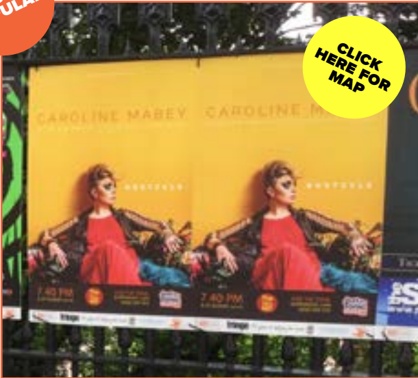
RAILING BOARDS - 30" x 20" (Double crown)

Cost effective option, fitted in pairs of the same artwork unless otherwise stated for maximum impact. Boards are fixed to key railings sites across the city centre.